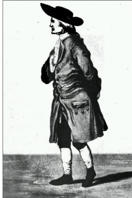
Figure 1: Sketch of Henry Cavendish, 1731–1810 (after http://en.wikipedia.org/wiki/File:Cavendish_Henry.jpg ).

making the long journey from Yorkshire to London in order to attend meetings ( ibid. : 301), so it is strange that he decided not to present this important paper himself. Maybe the disruptive nature of the Society's meetings at this time prompted him to stay away from London. Alternatively, his paper was speculative, so perhaps he felt that it would gain greater acceptance by his peers if presented by his illustrious colleague.