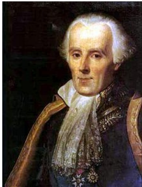
Figure 3: Pierre-Simon Laplace, 1749–1827 (after http://en.wikipedia.org/wiki/Pierre-Simon_Laplace#References ).

The Sun lies in the centre of the Solar System and spins on its axis every twenty-five and a half days and its surface is covered with 'oceans' of luminous matter spotted with dark patches. The atmosphere above this extends beyond recognition. Around the Sun spin the seven planets in almost circular orbits. However, Laplace did not consider comets to be part of the Solar System as some travelled in highly eccentric orbits, and while they moved into the Sun's domain they also moved far beyond the planetary sphere.